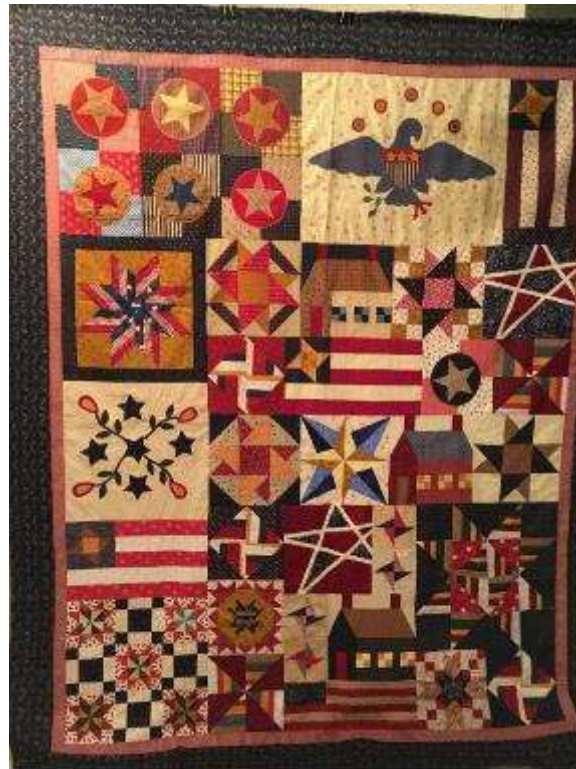
2017 Garland Guild Raffle Quilt “America Strong”