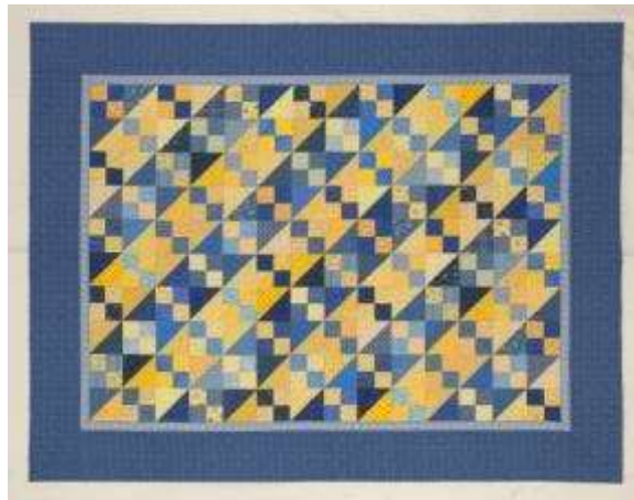
Texas Two Steps: down the Line

Stay tuned for details of the next workshop, which will be in June.