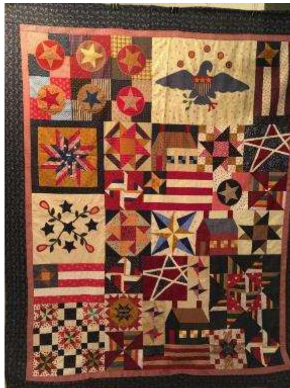
2017 Garland Guild Raffle Quilt “America Strong”