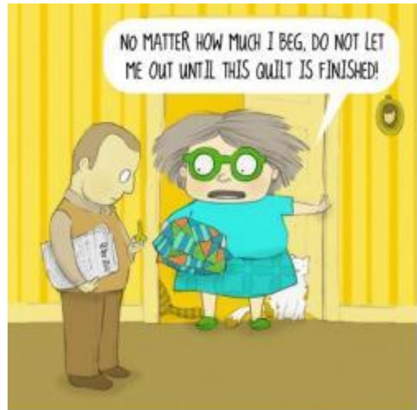
Quilt Show Panic, Stage Two: The All-Nighter

Please note that if the Garland or Dallas Independent Schools are closed for inclement weather, the Guild will not have their scheduled meeting. Our members' safety is very important to us.