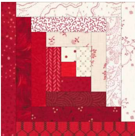
Log Cabin Bock

We will be making a Log Cabin Quilt. Minimum size is 63" X 63". Good Luck to everyone!