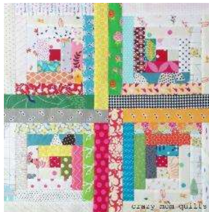
Log Cabin Quilt